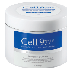
Energizing Cream 500g Nutrient-rich cream made from natural ingredients that replenishes the inner skin and creates a protective layer on the surface