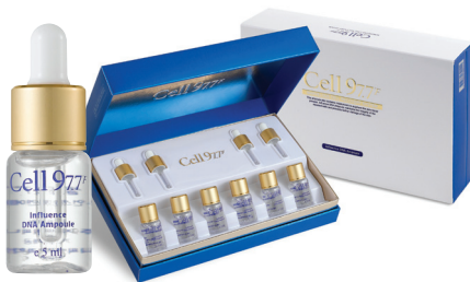
Influence DNA Ampoule 5ml x 6ea

Wash-off pack that gives vitality to the skin tired from harmful external environment and aging