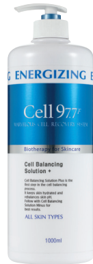
Cell Balancing Solution(+) 1000ml (+) ion toner that enhances skin barrier and supplies enriched hydration by adjusting the pH balance