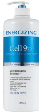
Cell Balancing Solution(-) 1000ml Boosting (-) ion toner that eliminates waste matter and helps to absorb the product used in the following step