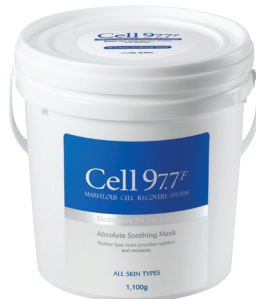
Absolute Soothing Mask 1100g Modeling pack that quickly soothes and moisturizes sensitive skin