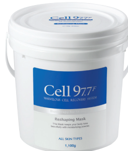
Re-shaping Mask 1100g