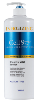
Effective Vital Solution 1000ml Base solution toner that smoothens and moisturizes dry and rough skin