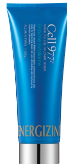
Enzyme Exfoliant 200g

Anti-wrinkle ampoule that gives the skin bounce and vitality like a baby's skin