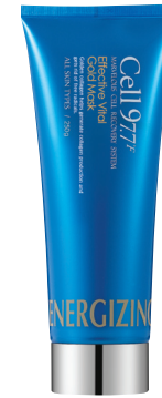
Effective Vital Gold Mask 250g

Intensive care anti-wrinkle cream that treats even the deepest wrinkles through concentrated formula that goes on smooth