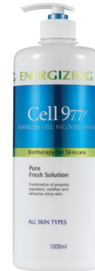
Pure Fresh Solutions 1000ml Toner that contains patented effective factor for controlling excessive sebum and soothing skin troubles