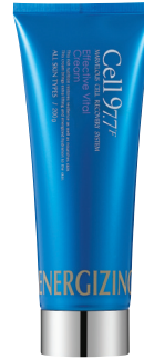
Effective Vital Cream 200g

Nutrient serum that fully tightens the tired skin through rich nutrients