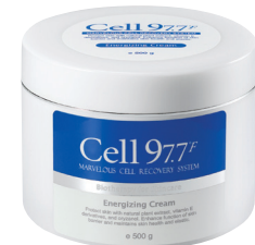
Marine Massage Cream 500g Face & body massage cream that contains marine collagen