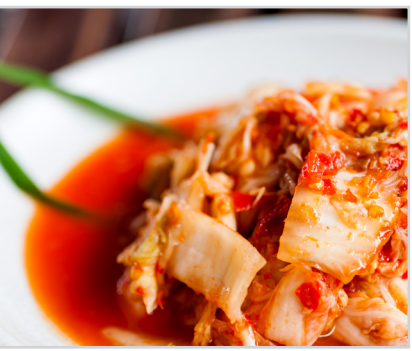
Healthier food with Energy Water