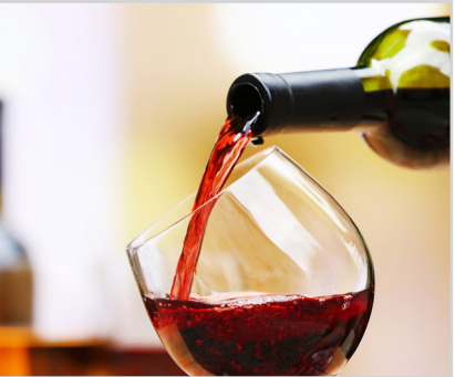
Softer drinking with Energy Water