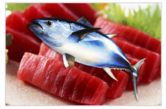
Food preservation and distribution