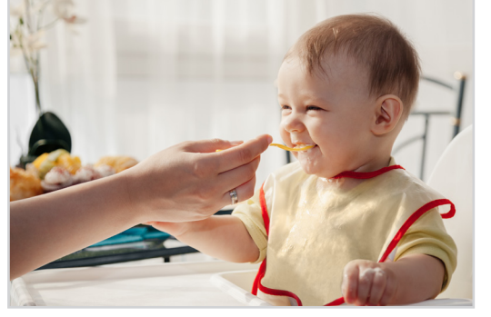
Energy Water for baby food