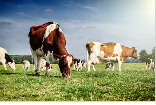
Healthy and disease-resistant farm products